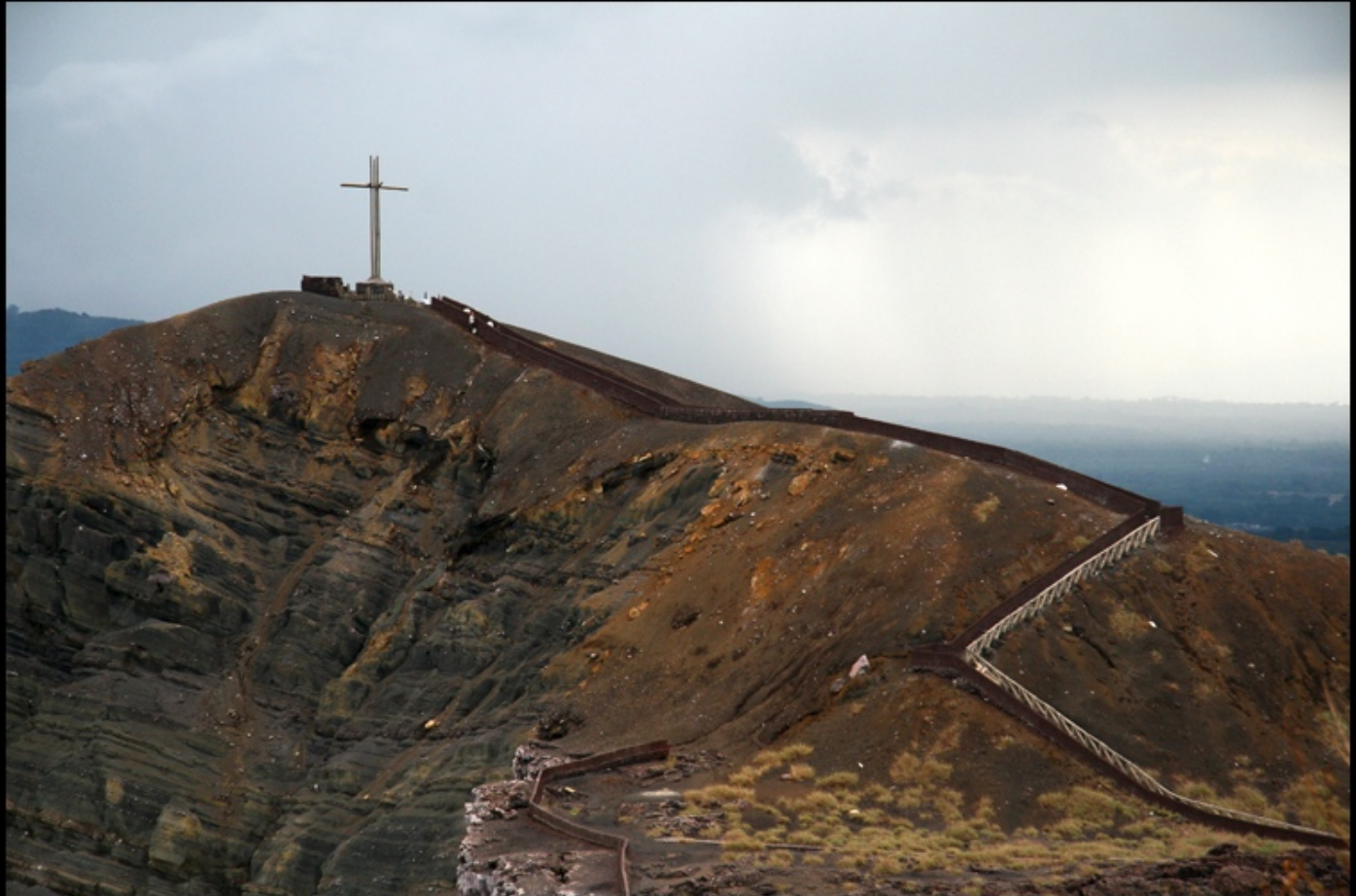
PATH OF THE CROSS