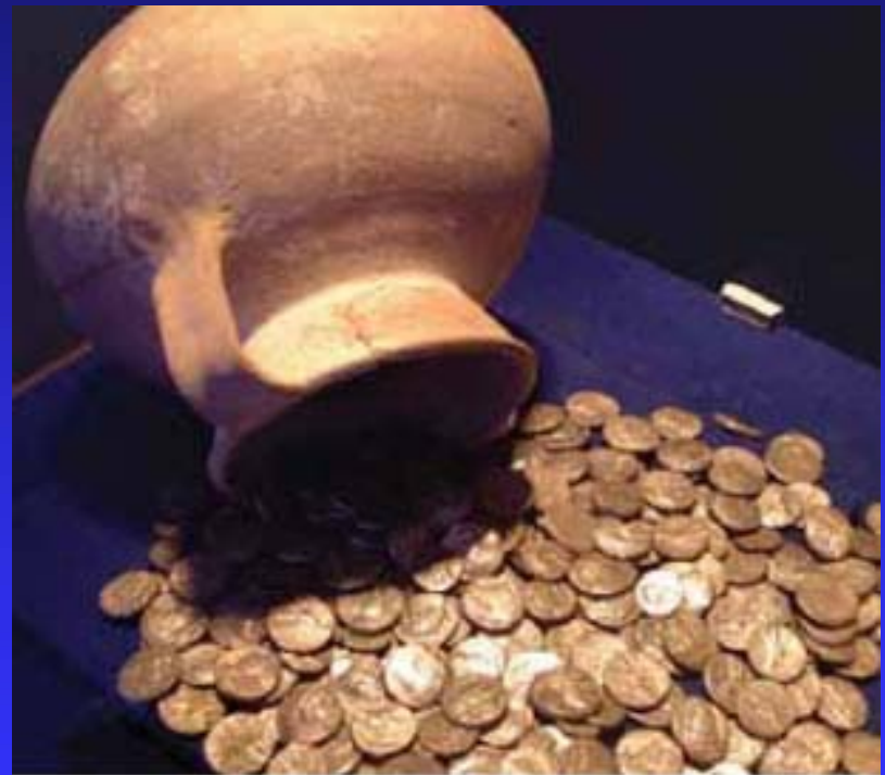
A horde of Roman coins. Preserving Bible Times